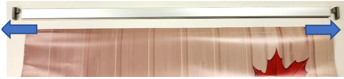
Remove the plastic end caps