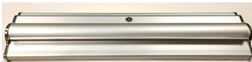
Put the chrome end cap on