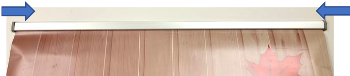
Press down to close the top bar and put the end caps on