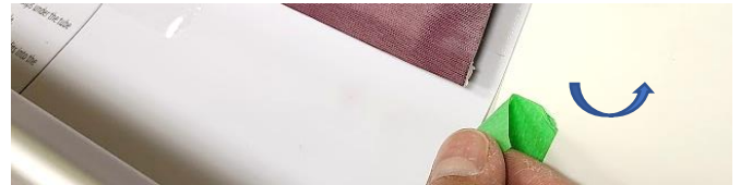
Remove the masking tape