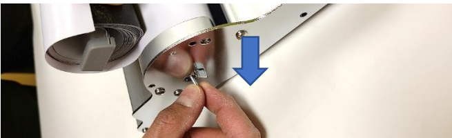
Remove the chrome end cap and pull out the safety pin