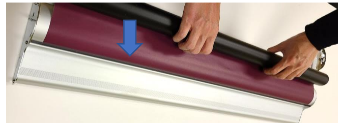
Let the graphic slowly roll into the hardware