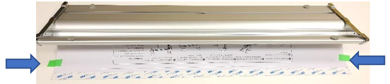
Place the hardware upside down and secure the paper with masking tape