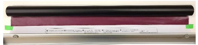
Attach the graphic onto the paper