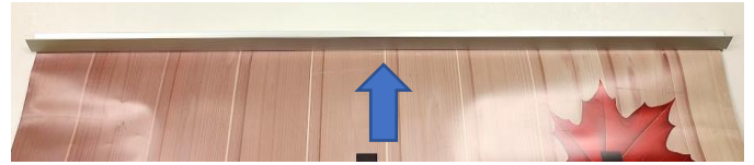
Open the top bar and slide the graphic into the top bar