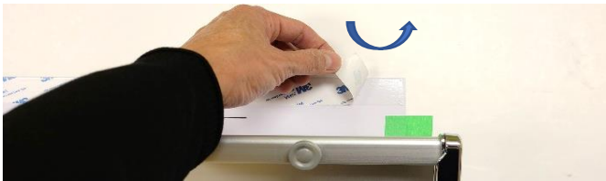
Remove the adhesive liner